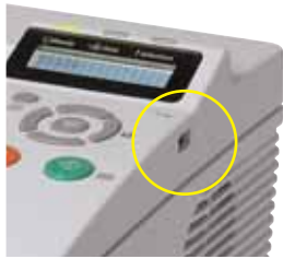
Print your files directly from memory using the convenient USB Host Interface