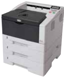
FS-1350DN shown with 2 additional paper feeders for an 800 sheet paper capacity