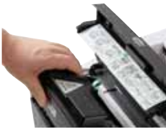
Replace the long life toner container quickly and easily